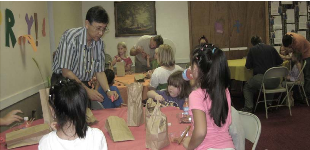
Helpers And Children - Snacks followed nature hunt