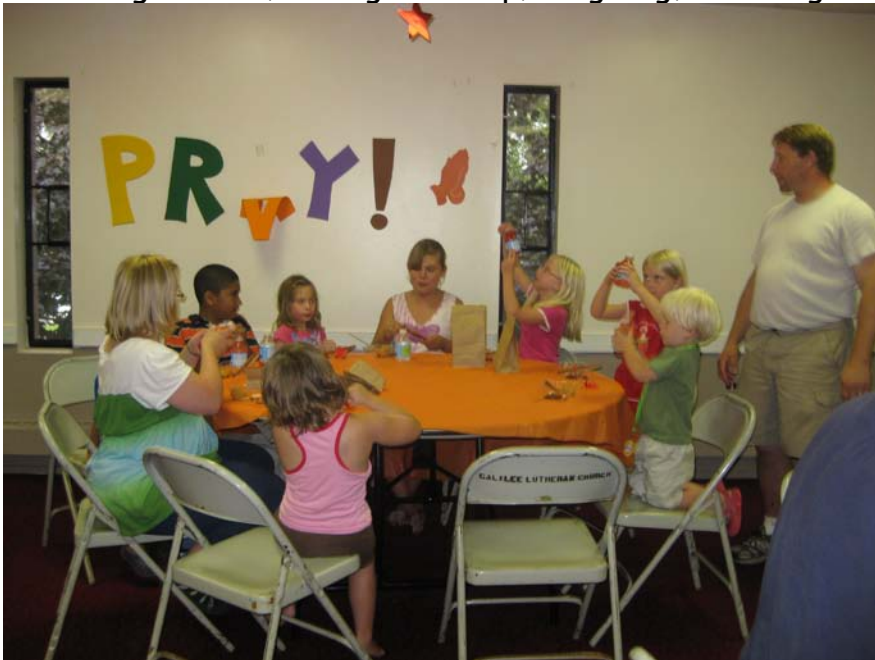
VBS THEME: PRAY - August 2010