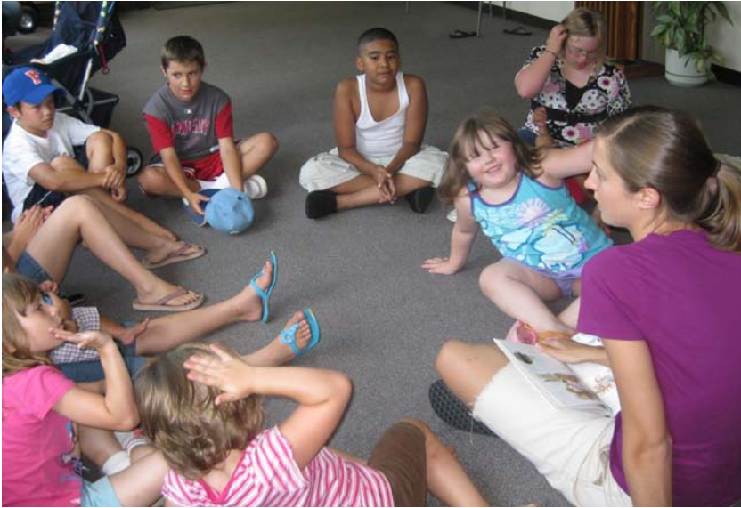
Giving Thanks, Asking for Help, Forgiving, Listening