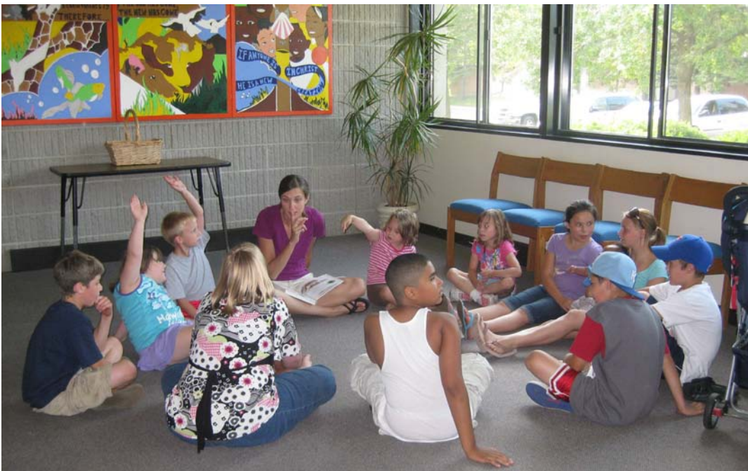
Bible stories in narthex